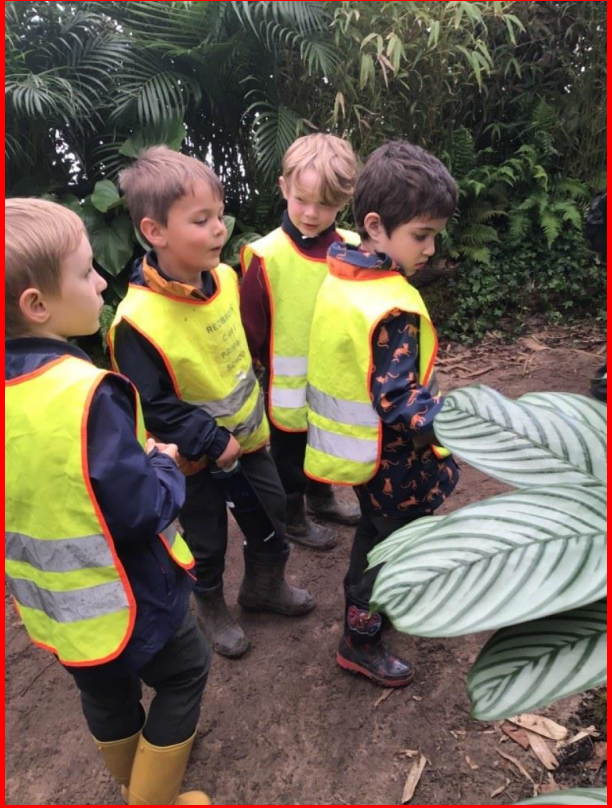
King Charles III Coronation Celebrations