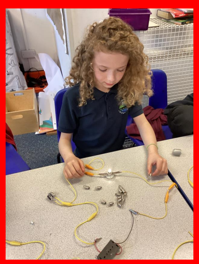
3 - Year 3 and 4 electricity science experiments.