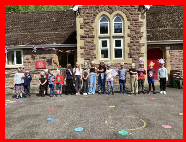
5 - The Coronation Crown Parade!