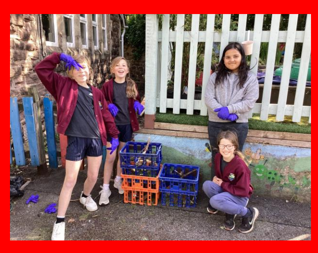
1 - Making bug hotels to inspire our writing about 'Beetle Boy' (our second book in English this half term) last week.