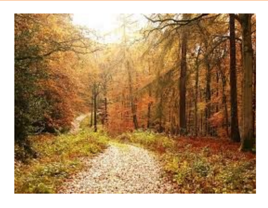
Courage Compassion Respect Resilience