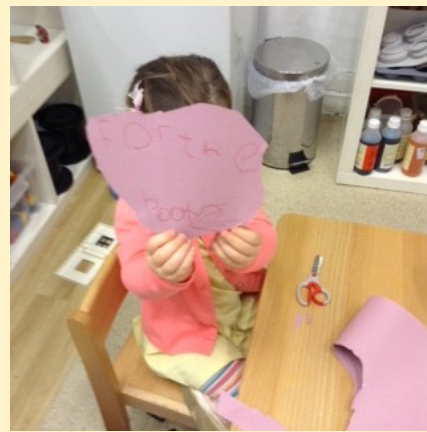
Schloastic books arrive in Poppy Class and a thank you card from Sunflowers for theirs!